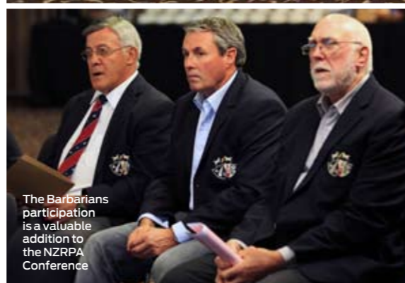
The Barbarians participation is a valuable addition to the NZRPA Conference