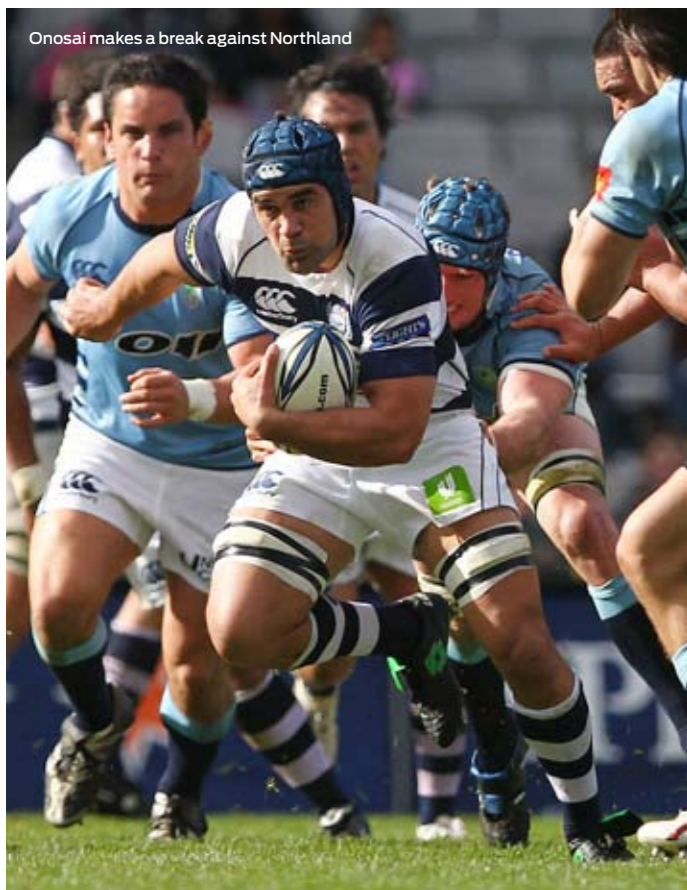
Onosai makes a break against Northland