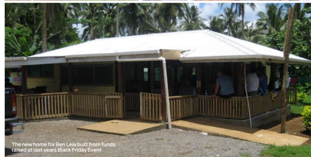
The new home for Ben Leia built from funds raised at last years Black Friday Event