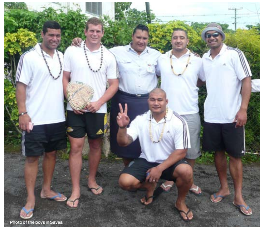
Photo of the boys in Savea