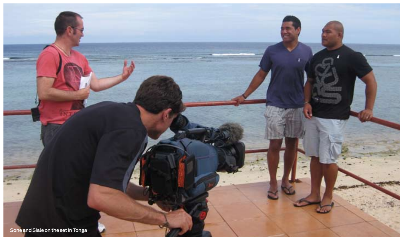
Sone and Siale on the set in Tonga

NZRPA members had taken part in a visit of this kind. Members of the Hurricanes squad were in Samoa in 2009; however that visit took on a double meaning following the devastating Tsunami which struck Samoa.