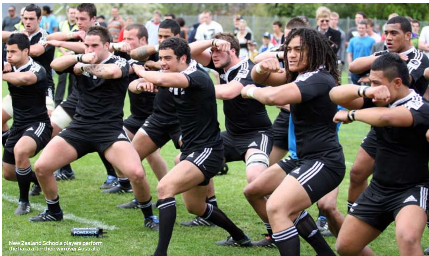
New Zealand Schools players perform the haka after their win over Australia