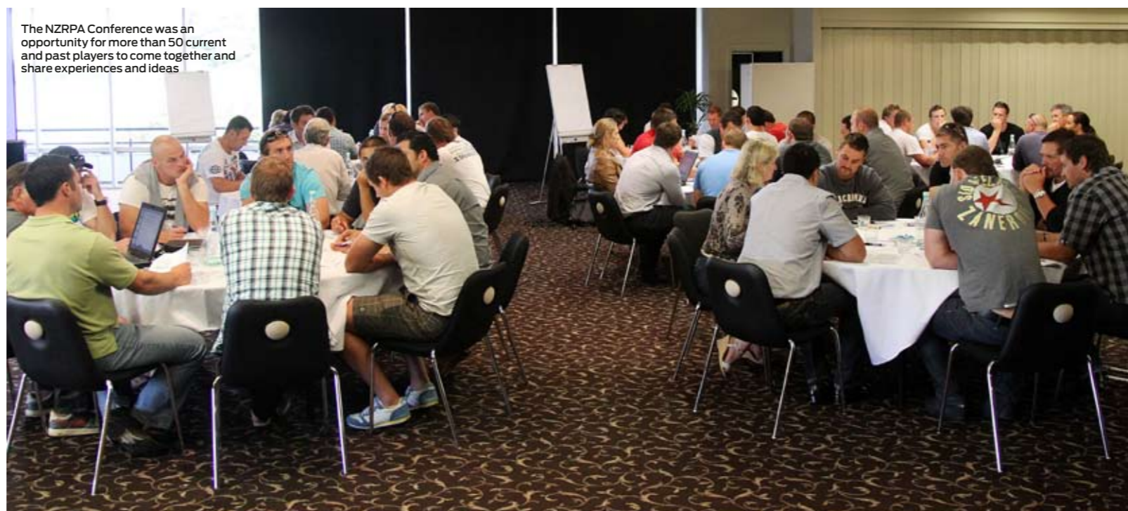
The NZRPA Conference was an opportunity for more than 50 current and past players to come together and share experiences and ideas