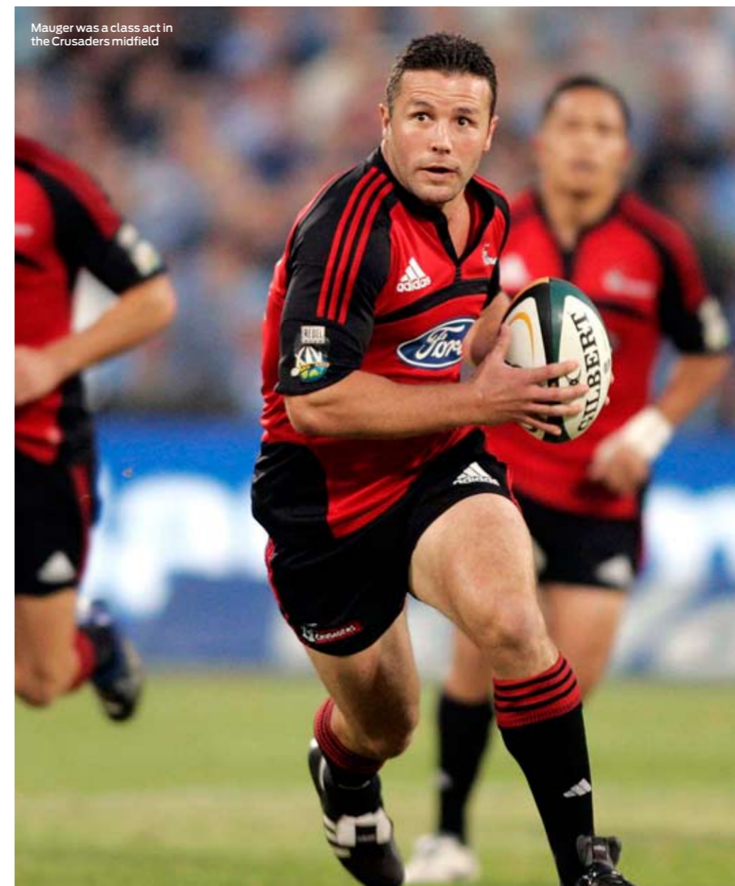
Mauger was a class act in the Crusaders midfield

Key focus areas include career, education, personal planning (including financial) as well as transition management both into and out of the rugby environment.