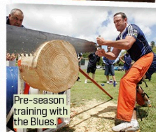
Pre-season training with the Blues.